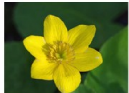
Marsh Marigold, a similar native

Do you have a mystery plant or suspected invasive species?