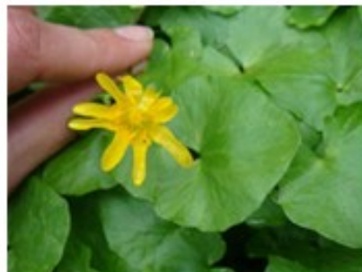
Lesser Celandine close-up