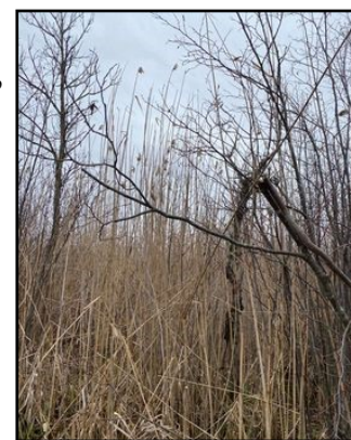
Invasive phragmites identified during monitoring in April.